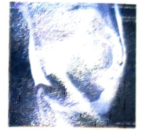
MRI pelvis showing the mass (5X4 cm) in rectovesical pouch

A 50 years old male presented with dull aching pain in lower abdomen with increased frequency and urgency of urine. He had normal prostate on digital rectal examination and ultrasound. Ultrasound KUB showed a mass of 5x 4 cm size behind the bladder. MRI abdomen revealed a mass of 5X4 cm in rectovesical pouch. The mass was well circumscribed and not attached with rectum or bladder. Laparoscopy revealed a free floating egg shaped, glistening white mass in rectovesical pouch. Mass was not attached to any pelvic structure. It was removed in an endocatch bag. Histopathology revealed an acellular, proteinaceous mass with central core of fat consistent with the picture of peritoneal mouse. His urinary symptoms and pain subsided after surgery.