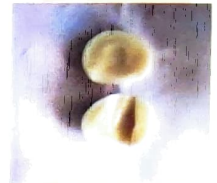
Cut section of the mass

Discussion: Peritoneal mouse presenting with symptoms of overactive bladder is very rare. Only a few cases have been reported of peritoneal mice presenting with lower urinary tract 3 symptoms. One case was reported of urinary retention due to a giant peritoneal mice. The current case was unique in the sense that it presented with lower urinary tract symptoms mimicking prostatic enlargement. Mechanical compression of the mass over the bladder neck area produced irritative and obstructive urinary symptoms. Patient fully recovered after removal of the peritoneal mice. Peritoneal mice should be distinguished from other benign lesions like leiomyomas, fibromata, desmoid tumors, teratomas, metastatic lesions of ovarian cancer, calcification of lymph nodes, and 4 mesenteric cysts. All these masses tend to enhance on MRI except peritoneal mice .